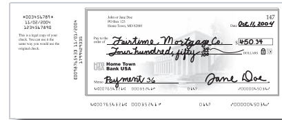
Front of a substitute check

A substitute check is a special paper copy of the front and back of an original check. The substitute check may be slightly larger than the original check. Substitute checks are specially formatted so they can be processed as if they were original checks. The front of a substitute check should state: “This is a legal copy of your check. You can use it the same way you would use the original check.” The following sample shows what a substitute check looks like.