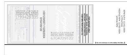
Back of a substitute check

Not all copies of a check are substitute checks. For example, pictures of multiple checks printed on a page (also known as an image statement) that is returned to you with your monthly statement are not substitute checks. Online check images and photocopies of original checks are not substitute checks either. You can use image statements and other copies of checks to verify that your bank has paid a check.